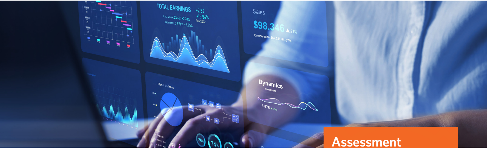
Tableau Analytics Maturity Model